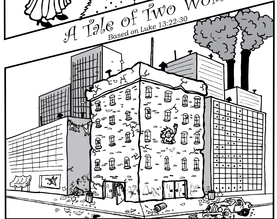
Color the dotted windows, above.

Across: 1. She gave the poor men _____. 2. After she _____, 3. the county _____ took her body, 4. and said, "I _____" when asked who she was. 5. She thought her heavenly mansion was a _____. 6. She didn't know she had made a _____ for herself.