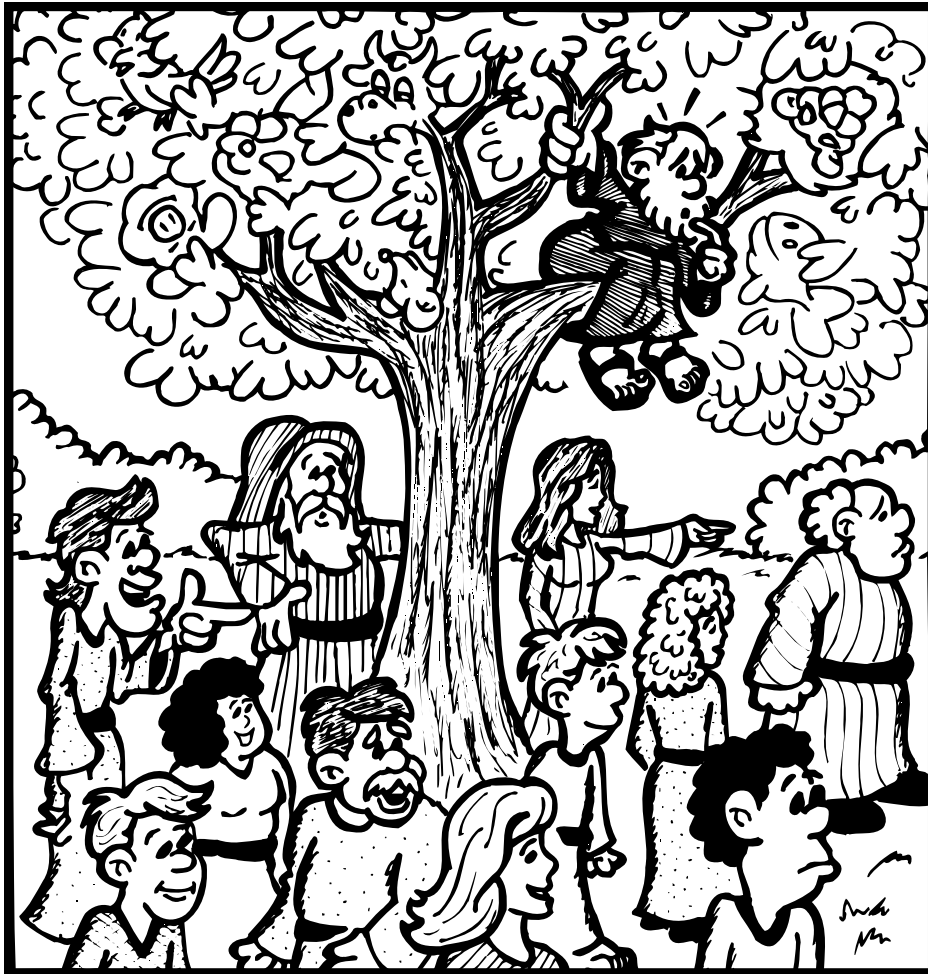
How many animals can you find hidden in the tree?

One day Zack noticed that everyone was excited about something, but no one would talk to him and tell him why. Since he was too short to see over the crowd, he clambered up a tree to get a better look.