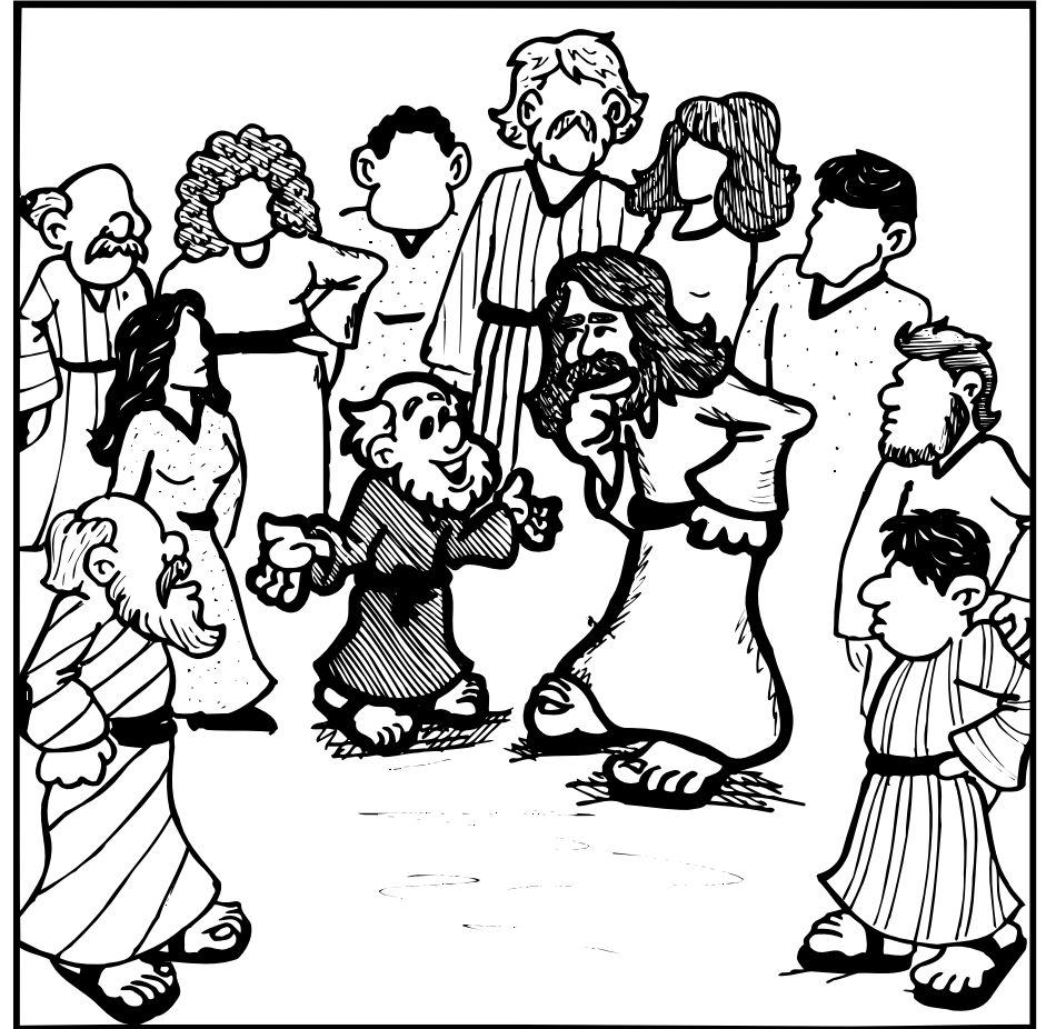
Give the people angry faces.

tree see chances branches climb crime time look took why spy cry high sky