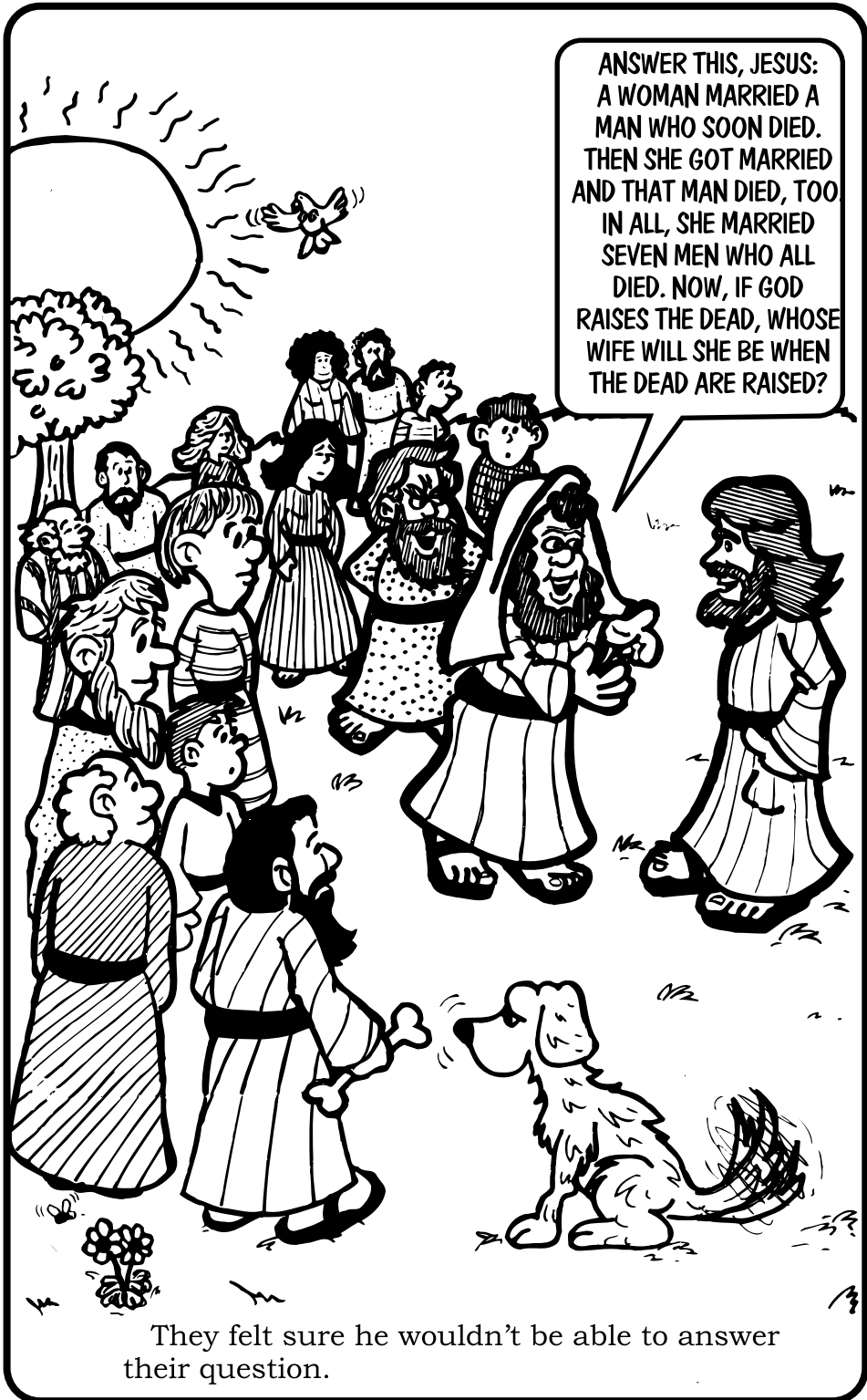
They felt sure he wouldn't be able to answer their question.

ANSWER THIS, JESUS: A WOMAN MARRIED A MAN WHO SOON DIED. THEN SHE GOT MARRIED AND THAT MAN DIED, TOO IN ALL, SHE MARRIED SEVEN MEN WHO ALL DIED. NOW, IF GOD RAISES THE DEAD, WHOSE WIFE WILL SHE BE WHEN THE DEAD ARE RAISED?